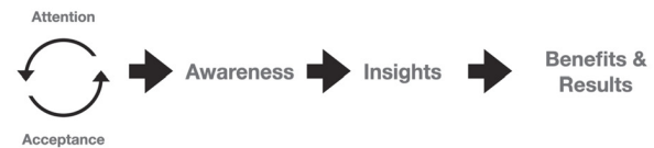
Figure 1. Flowchart on the four mechanisms of mindfulness (Kathirasan & Sunita, 2023)

as stress reduction, prevention of relapses of depression, increased levels of happiness, and clarity over purpose among others.